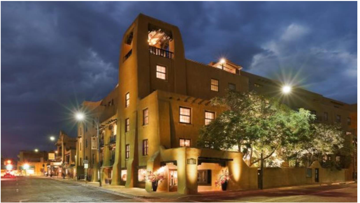
La Fonda on the Plaza, Santa Fe, New Mexico. SIPES National Convention Site, June 11-14, 2018